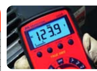
See the larger, more feature-rich multimeters—the XR Series on pages 8 and 9